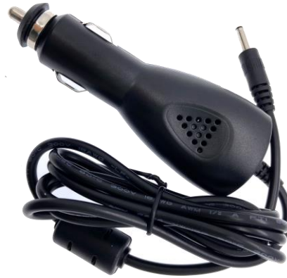
Car power supply unit for vehicle mount