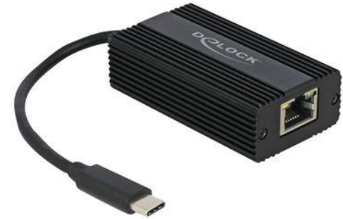
USB-C GigaBit network adapter

Adds a network interface to the Rocktab L110 via the USB Type-C port