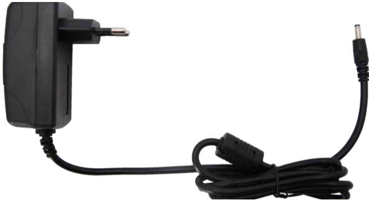
Power supply unit for docking station